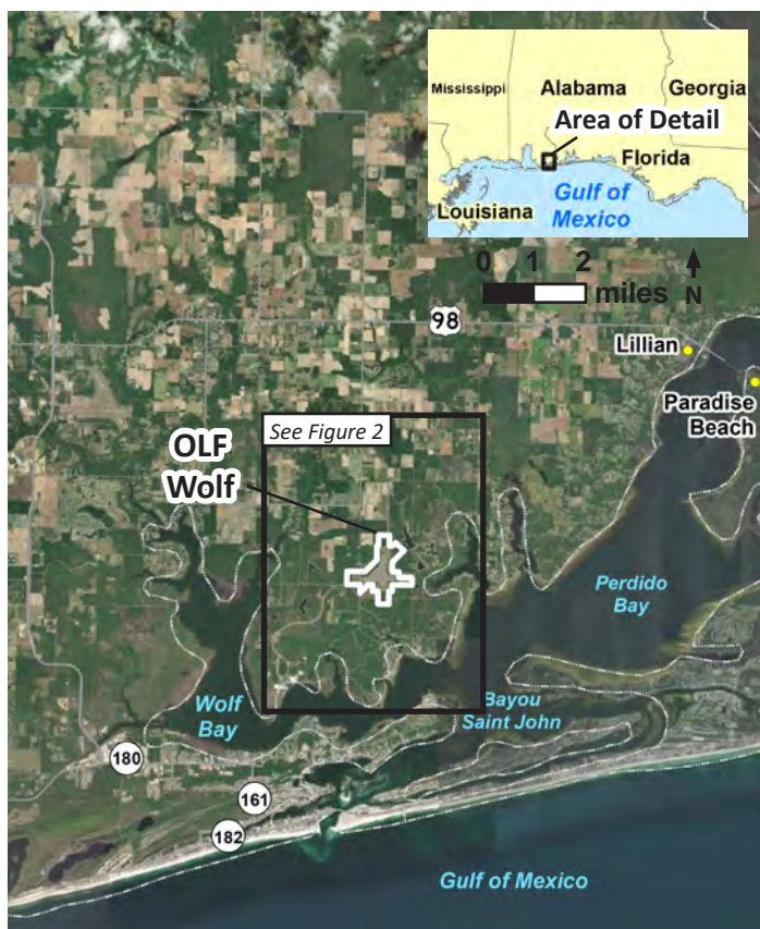
Figure 1 – OLF Wolf

There is no legal requirement to conduct this drinking water testing. The Navy is performing this voluntary testing because it is important