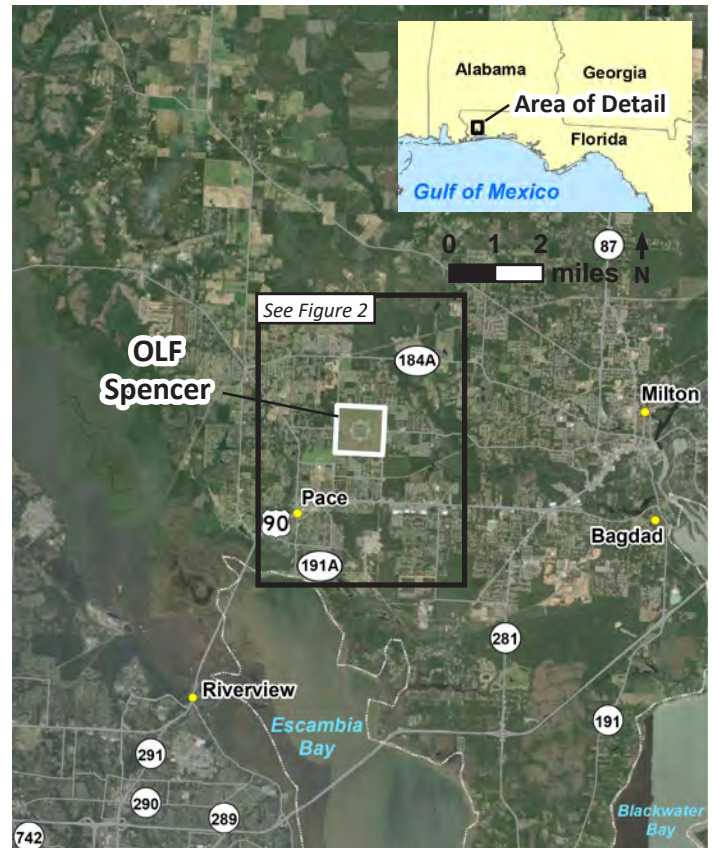
Figure 1 – OLF Spencer

In 2020, a comprehensive Preliminary Assessment (PA) was completed at the OLFs in Florida associated with NAS Whiting Field. It identified potential historical releases of firefighting foam to the environment during activities such as testing, training, firefighting, and other life-saving emergency responses. The PA identified three sites, the 2005 Aircraft Mishap, the 2016 Hard Landing, and the Firehouse/Blockhouse, where firefighting foam may have been released to the